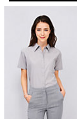
SOL'S ESCAPE 16070