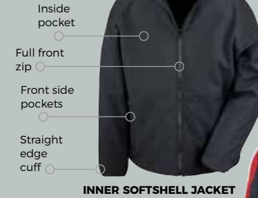
INNER SOFTSHELL JACKET

R400M&F FABRIC OUTER: WATERPROOF 3000mm, BREATHABLE 3000g, WINDPROOF INNER: SHOWERPROOF, WINDPROOF LINING: 100% Polyester INNER JKT: 280g/m 2 100% Polyester 2-layer soft shell OUTER JKT: 100% Polyester ripstop