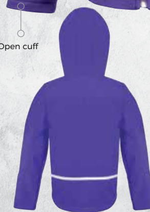
Fashionable shaped longer back panel with reflective detail